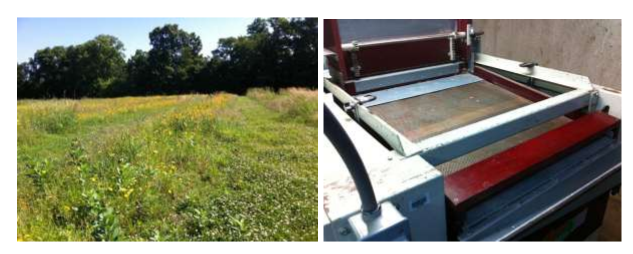
NATIVE INDIANA WILDFLOWERS ARE GROWN ON PUTNAMVILLE GROUNDS, THEN INMATES DRY, PROCESS, PACKAGE, AND PROVIDE THE SEED TO THE HIGHWAY DEPARTMENT TO BE PROPAGATED ALONG HIGHWAYS.