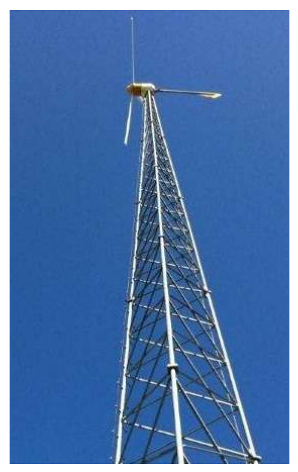
PUTNAMVILLE'S WINDMILL POWERS THE TRAINING CENTER