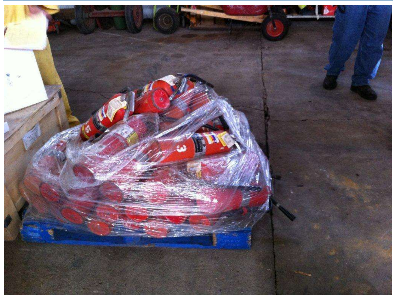
FIRE EXTINGUISHERS READY TO BE RECYCLED