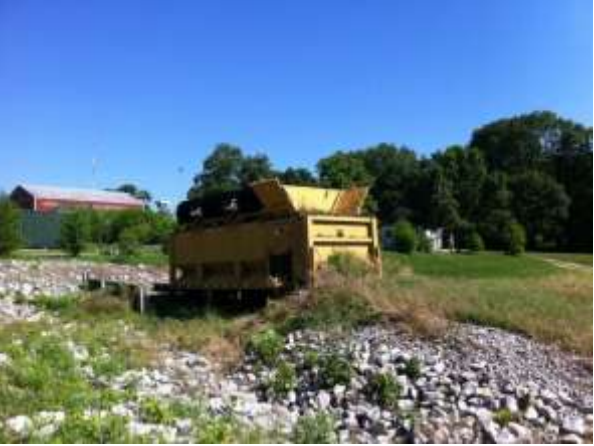
FOOD WASTE IS MIXED WITH WOOD CHIPS, PROCESSED IN HEDGEROWS THEN SCREENED TO REMOVE TRASH