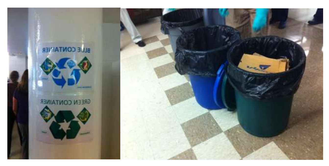
RESIDENCE HALL RECYCLING PROGRAM HAS GROWN INTO A VOCATIONAL TRAINING PROGRAM SUPPORTED BY THE U.S. DEPT. OF LABOR