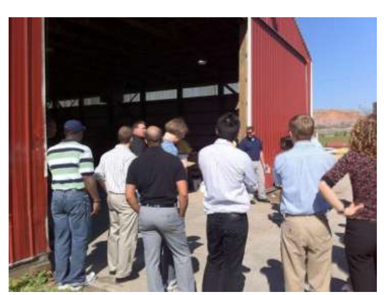
TOUR ATTENDEES VIEW THE RECYCLING FACILITY