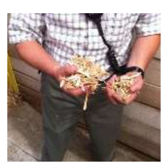
SCRAP WOOD FROM THE FACILITY'S PALLET RECYCLING OPERATION IS SHREDDED AND FED INTO THE BIOMASS BOILER, WHICH PROVIDES HEAT TO THE ENTIRE FACILITY THROUGHOUT THE YEAR.