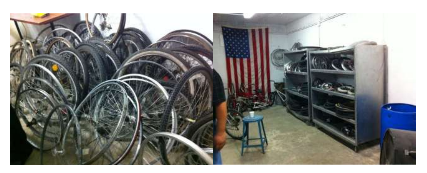
ABANDONED AND DAMAGED BICYCLES ARE COLLECTED BY FACILITY STAFF, SO THAT INMATES TRAINEES CAN REFURBISH THEM. PUTNAMVILLE WORKS WITH LOCAL BUSINESSES AND CHARITIES TO RECYCLE MORE THAN 720 BICYCLES PER YEAR, WHICH ARE THEN DONATED TO NEEDY CHILDREN THROUGHOUT THE STATE.